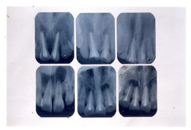
Fig. 1: Pre Operative IOPA's showing Bilateral Lesions

The wounds in general pose a challenge of reinfection/infection during healing process, this is even more true in case of oral wounds because of the increased challenge in the form of plaque and food