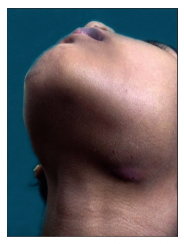
Figure 1: Diffuse swelling in left submandibular region.

central caseous necrosis (Figure 2). The report gave feeling as "TB lymphadenitis"