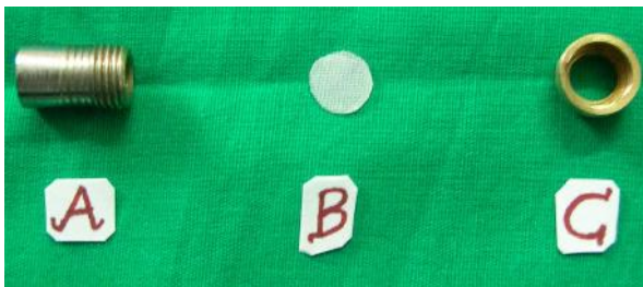
Figure 3: Metal tube (A), Stiff membrane (B) and Metal cap (C).