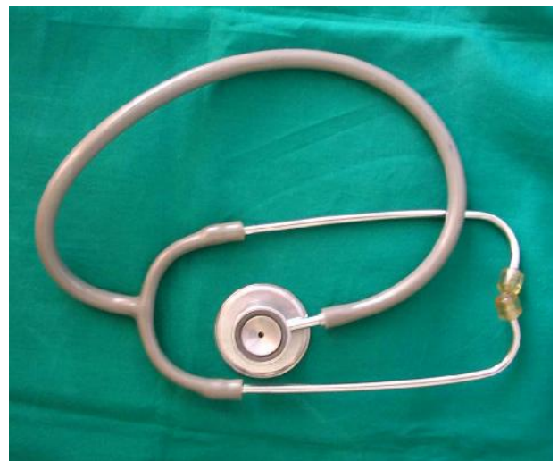
Figure 1: Conventional Stethoscope.

Mechanism of mastication is extremely complex. It is made up primarily of muscles, joints and teeth. The temporomandibular joint (TMJ) is most complex component of masticatory system and its disorders are very common. One of the characteristic features of many patients with TMJ disorders is joint sounds. A widely used method for joint sound detection is stethoscope auscultation. Leknius & Kenyon stated that the external auditory meatus (EAM) is closest anatomically approachable structure to the TMJ, and the auditory canal has been shown to be more sensitive than surface of the skin when evaluating joint sounds. 1 Taking this into consideration the present research was planned.