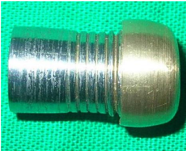
Figure 2: Soundscope.

inches is a good compromise between the ideal of 12 inches and the usual length of 20 to 22 inches that are commercially available. Reflected waves in the tubing may amplify sounds. Therefore, different tubing lengths may amplify different frequencies. The thicker the tube, the better is the elimination of room noise. A vinyl tube has been found to be better than rubber for this purpose. Very narrow tubes carry low frequencies best and wide tubing carries high frequencies best. An internal diameter of 3 mm was once recommended as the ideal compromise for carrying both frequencies. However, it has recently been