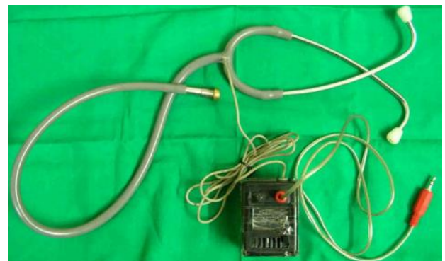
Figure 6: Modified Stethoscope