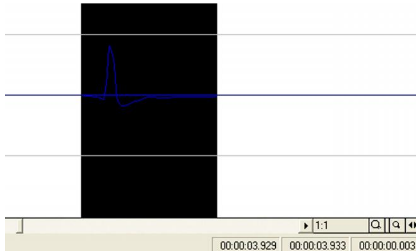
Figure 10: Sound length graph.