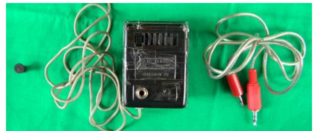
Figure 4: Controlling Unit, Recording Device & multimedia Cord.