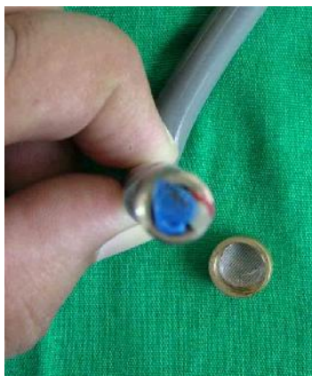
Figure 5: Recording device fitted in soundscope.