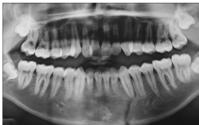
Figure 3: Pre-operative orthopantomogram showing fracture of left parasymphysis of mandible.