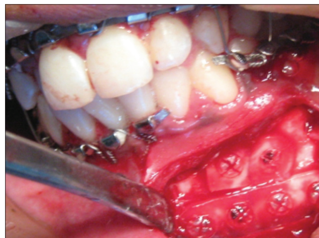
Figure 4: Internal fixation with self-reinforced polylactic and polyglycolic acid copolymer plates and screws - 2.5 mm.