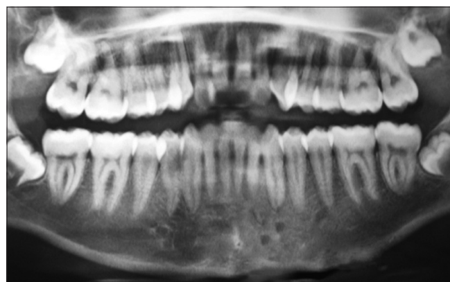
Figure 6: Post-operative 6 months orthopantomogram.