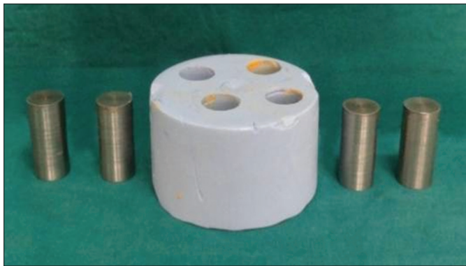
Figure 1: Stainless steel cylinder and mold space in Poly vinyl siloxane impression material.

Knoop microhardness test was performed using a hardness tester, equipped with knoop diamond indenter, in accordance with ADA specification No. 25 for dental gypsum products. 9 Three indentations were obtained for each specimen using 300 g (3N) load for 20 s and average Knoop hardness number (KHN) of the three readings for each specimen was recorded. The obtained data was tabulated and subjected to statistical analysis.