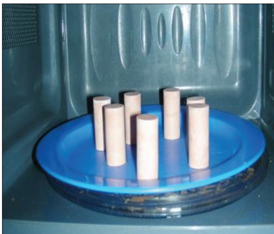
Figure 2: Specimens placed in micro oven after 1h for 10 min.