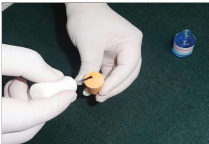
Figure 3: Application of die hardener.