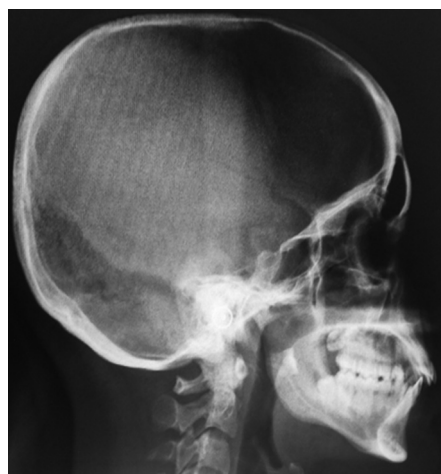
Figure 5: Bridging of sella turcica.