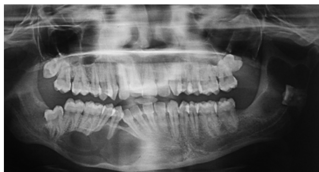
Figure 2: In 2014, orthopantomogram was taken, which showed two well-defined radiolucencies.