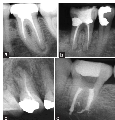
Figure 1: Some kinds of iatrogenic errors in root canal treatment. (a) Ledge (b) Apical perforation (c) Underfilling (d) Overfilling.

In Malaysia in the same year, the results of a 2 years study were reported to introduce void as the most common error in this matter like almost the rest of studies. 16 A rate of 65.5% for void was highlighted by Moradi and Gharechahi in Mashhad, Iran, which was higher in mandible when compared with the maxilla. 17