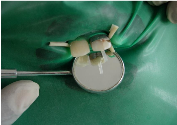
Fig. 5: Placement of FRC Post

the isoelastic properties of the resin cement, post and dentin.