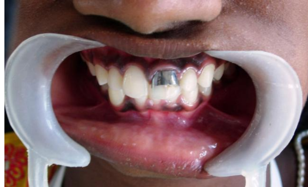
Fig. 2: Stabilization Done with Orthodontic Band

achieving access was not possible. Stabilization and approximation of the fragments was achieved by using pre-formed orthodontic band, which was cemented to the tooth by zinc phosphate cement.