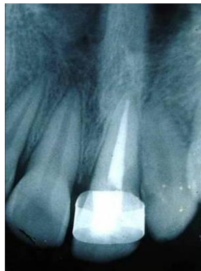
Fig. 4: Post-operative Radiograph Fractured