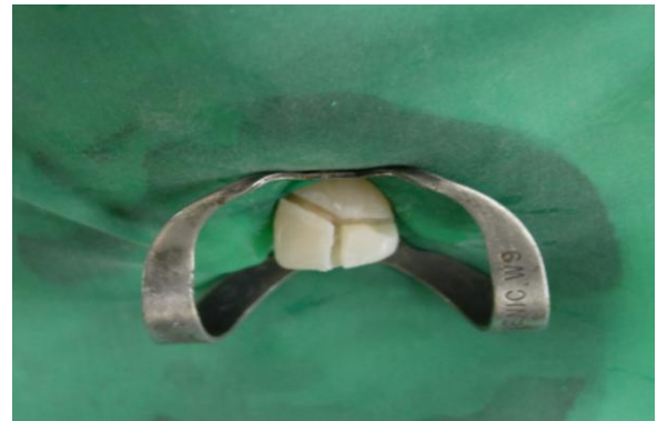
Fig. 6: Grooves prepared along Fracture Lines.

week's follow-up the tooth was restored with a provisional crown.