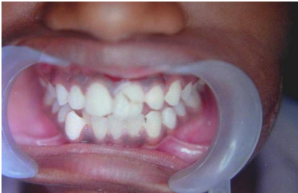
Fig. 1: Pre-operative Photograph of the Fractured 21

endodontically following conventional methods. The major concern in this case was giving a proper definitive restoration. After a week of root canal treatment post space was prepared by removing gutta-percha from the root canal space using a no.2 Pezzo drill, leaving the apical third intact. Later a fiber reinforced composite (FRC) post (size 2) was selected. The post space was