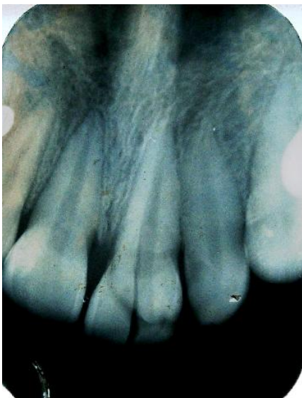
Fig. 3: Pre-operative Radiograph

etched for 15secs using 35% phosphoric acid, washed thoroughly and air-dried. Then the post space was painted with bonding agent and light cured for 20secs. The post space was filled with dual curing composite resin cement with the FRC post in place and light cured at an angle of 45° for 40secs at three levels. In this case, bonding of composite resin luting cement to the FRC post is both chemical and mechanical bonding because of