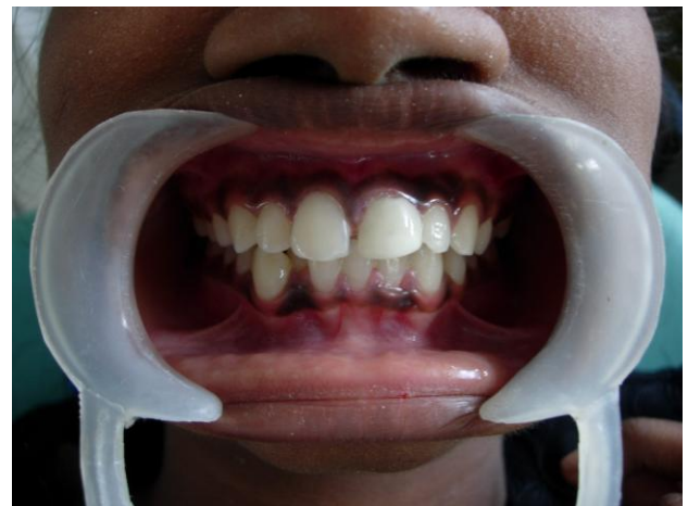
Fig. 8: Provisional Crown.

The aim of endodontic and restorative treatment is to restore the function, form and esthetics. Esthetics has an impact on psychology of an adolescent patient when it comes to anterior teeth. Traditionally cast posts have been used for restoration of endodontically treated teeth with complicated crown fracture. Recent advancements in adhesive dentistry lead to the usage of fiber-reinforced resin-based composite posts with resin